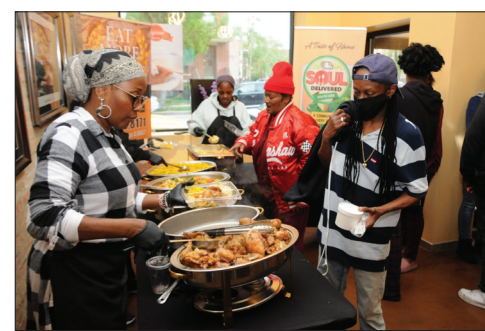
Minister Farrakhan provided free hot, delicious, nutritious meals to Chicago residents on his 90th birth anniversary on May 11, 2023.