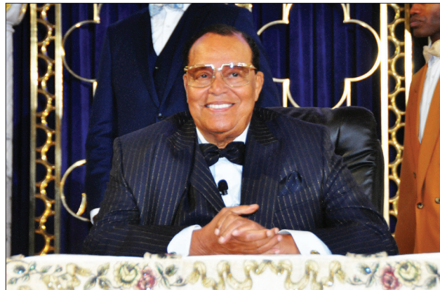
The Honorable Minister Louis Farrakhan

When you come into Islam, and you hear the promise of God, it satisfies us all, because we all want luxury and money,