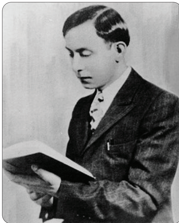
Master Fard Muhammad