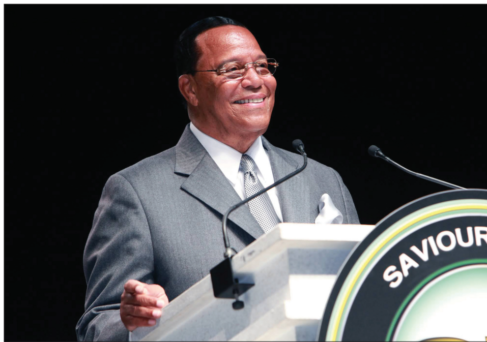
Saviours' Day 2014

On October 19, 2008, Min. Farrakhan rededicated Mosque Maryam following extensive repairs as part of "A New Beginning" for the Nation of Islam and an expanded universal mission. In July 2009, Min. Farrakhan spent several days traveling throughout the Caribbean island of Bermuda. He addressed the spiritual, economic, social and political ills plaguing not only Bermuda's residents but society as a whole. On March 20, 2010, Min. Farrakhan was a panelist during the "We Count!: The Black Agenda is the American Agenda" symposium held at Chicago State University. On June 26, 2010, Min. Farrakhan delivered the historic message answering a question asked by religious scholars and truth seekers for decades: "Who Are The Real Children of Israel?" In a message that was viewed live via webcast across the globe, Min. Farrakhan also announced the release of "The Secret Relationship Between Blacks and Jews," Volume