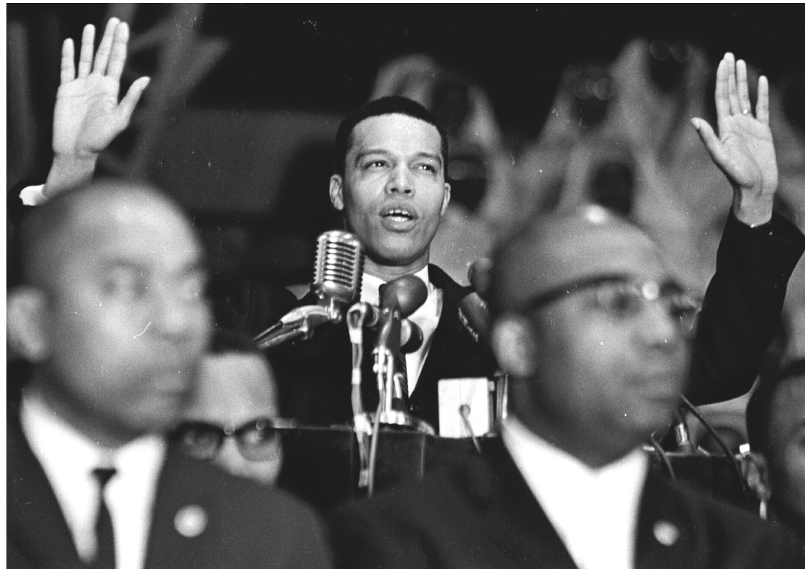
Nation of Islam leader Louis Farrakhan (born Louis Walcott) speaks during the Saviour's Day celebrations at the Chicago Coliseum, Chicago, Illinois, February 27, 1965.