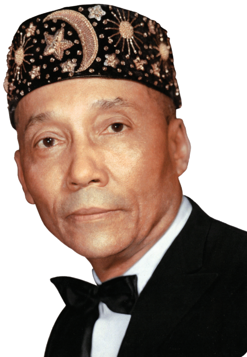
The Most Honorable Elijah Muhammad