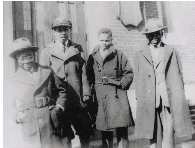
Minister Farrakhan, second from right, and friends who were members of the men and boys choir, St. Cyprian's Episcopal Church, Boston, circa 1941.