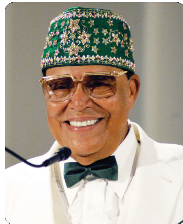
The Honorable Minister Louis Farrakhan