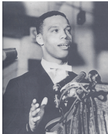
The Minister at Uline Arena in 1959 in Washington, D.C.