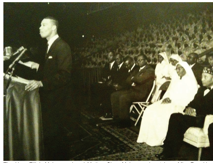
The Hon. Elijah Muhammad and Mother Clara Muhammad watch as Min. Farrakhan speaks.